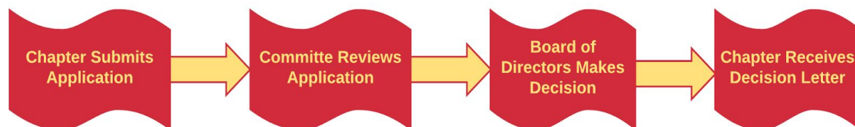
Figure 3. Process of Obtaining Provisional High School Chapter Status

Once you have completed these two steps, your NAPCA high school chapter will receive a letter from the NAPCA Organization granting status as an active high school chapter.